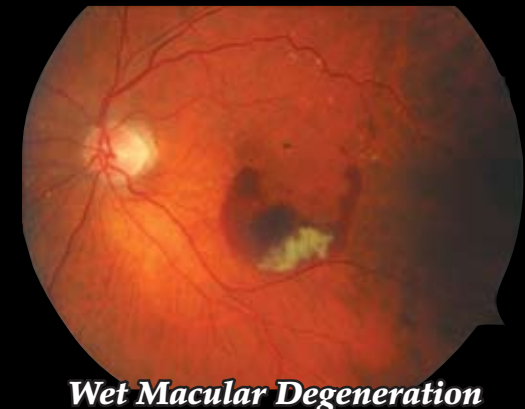
Wet Macular Degeneration